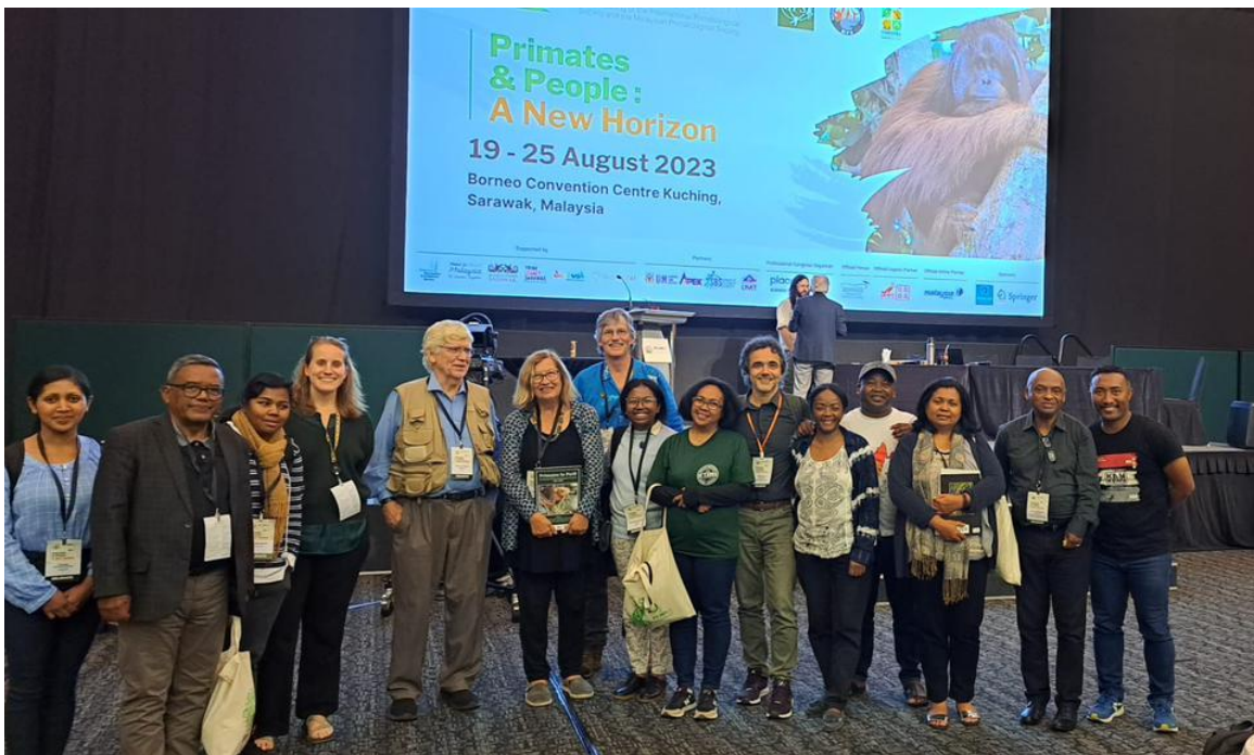
Photo 21 Malagasy delegates