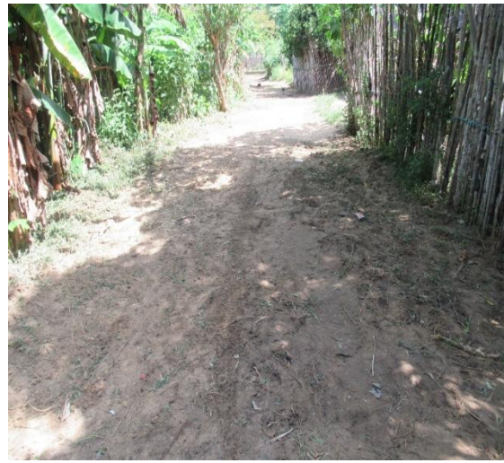
Photo 9 After cleaning