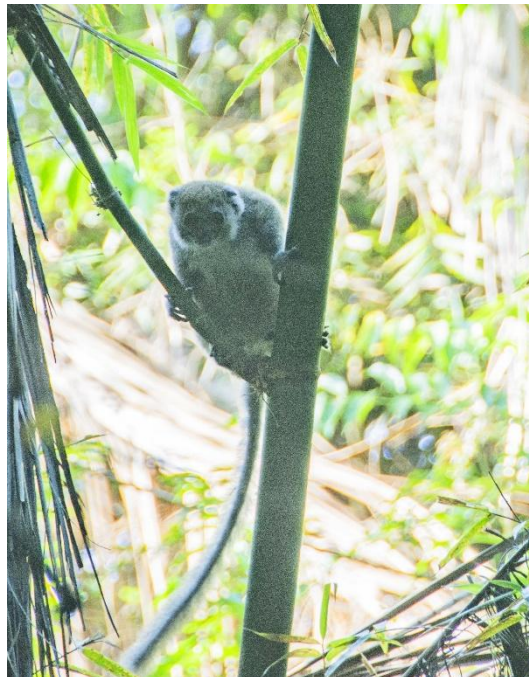
Photo 3 Western bamboo lemur in Andilambologno forest

The local rangers are still continuing regular lemur survey. During the survey, the following information were collected: vernacular name of the species, date of the observation, activity of the animal, number of the individual encountered, number of male and female, height of the substrate. In total, three (3) transects were followed, the length of the transect varied between 1.5km to 2km. In total, nine (9) groups of the blue-eyed black lemur were recorded as follows: 5 group counted within the transect T1, 3 groups within the transect T2 and only one group encountered within the transect T3. The group sizes ranged from 2 to 10 individuals with a mean of 5.17 individuals. In total, found during the survey we also counted three (3) groups of the western lesser bamboo lemur ( Hapalemur occidentalis ) and the group size ranged between 2 to 4 individuals.