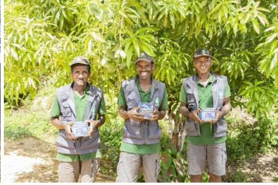
Photo 2 Rangers