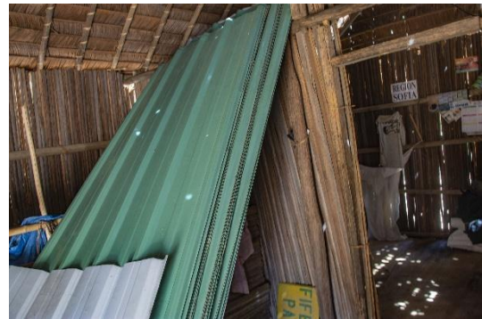
Photo 16 Roof