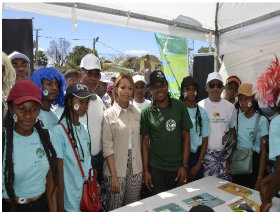
Photo 12 Minister visited our stand

We offered our T-shirt of 10 th anniversary to the Minister of Environment and Sustainable Development and her staff during her visit of our stand.