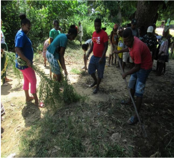
Photo 8 Cleaning

✓ The earth day was organized on April 22 nd in Mahitsihazo. We took the international topic which is invest to our planet. We undertook a group cleaning. The school yard was cleaned up by the villager. After that, we organized a friendly meal and fun game. In total, 200 people were present during this events.