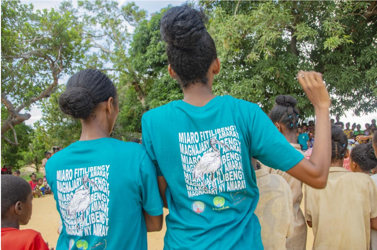
Photo 6 Educational T shirt with sacred ibis and message