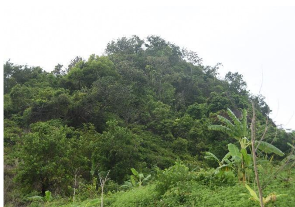
Photo 22 Forest in Ambodinambohimarina