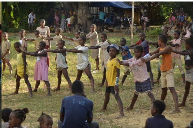
Photo 11 Funny games

✓ 10 th year anniversary celebration in Mahitsihazo on July 24 th , Mikajy Natiara was founded in 2023 by enthusiastic biologist in order to protect the biodiversity, to raise awareness and support the villagers. The Regional Director of Environment and Sustainable Development, Local Forestry Chief, Mayor of Maromandia and representative of Regional