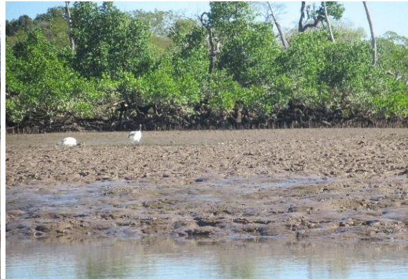
Photo 5 Sacred ibis observation

This project is still ongoing, survey close to the Loza Bay will be carried in the beginning of next year. More questionnaire survey will be carried out within the villages close to the Loza Bay will be surveyed in January 2024.