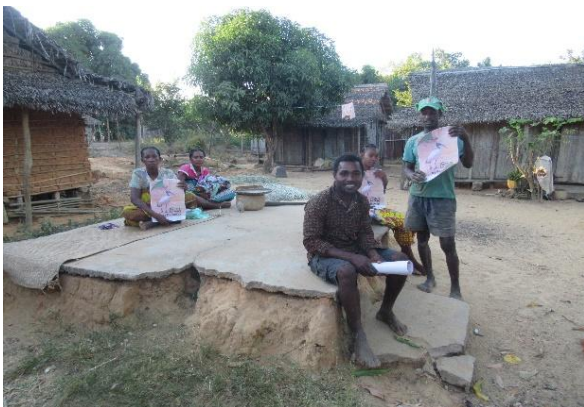
Photo 4 Questionnaires in village

We did a radio interview for the sacred ibis raising awareness (FM 103 Mhz Soafy Radio in Antsohihy).