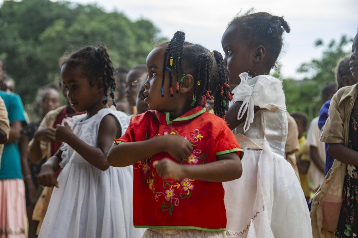
Photo 19 Kids dancing

The event was attended by the head of village, the director of school and parents. The head of village and the director of school thanked us. According to them, this kind of activity has never been organized in the village and they wanted Mikajy Natiora to continue. It encourages children not only to go to school but also to protect biodiversity.