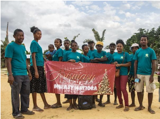
Photo 18 Teachers