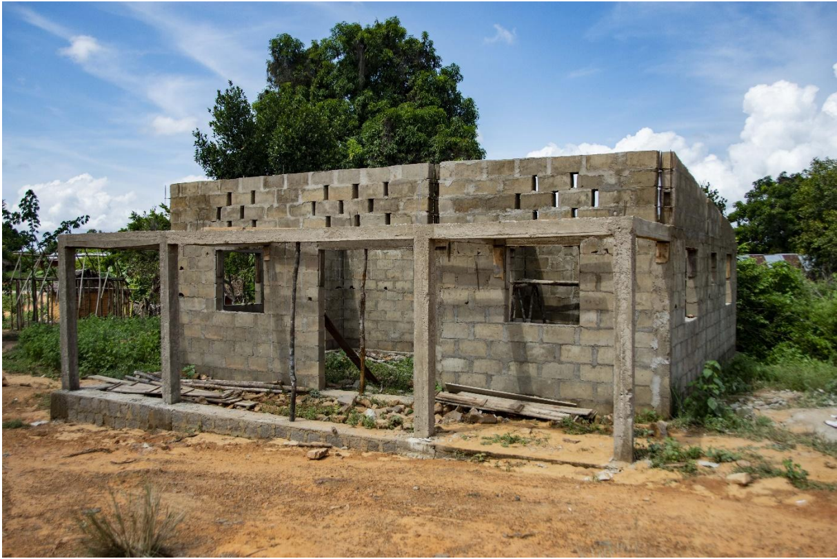
Photo 14 Building