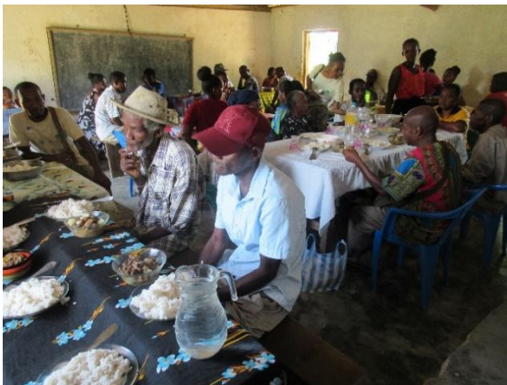
Photo 10 Lunch with community