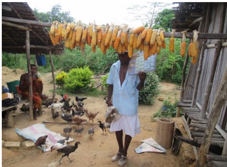
Photo 7 Beneficiary of the alternative livelihood activity

In order to decrease the dependence of the natural resources, we have implemented alternative livelihoods project within the village of Mahitsihazo, close the forest of Andilambologno forest. Three (3) activities have implemented including bee keeping, fast growing crop (maize) and poultry rearing since 2021.