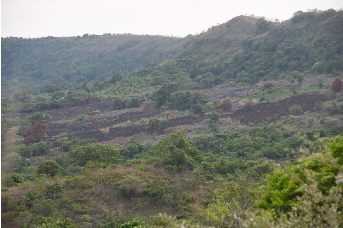
Photo 23 Slash and burn agriculture around the mountain

After the visit, we asked villagers who supposed to have crops there. They said that this land belongs to them and they don't want to plant anything on it. They are afraid that in the future, they will be deprived of this land. There are even rumors circulating that someone has already sold us this mountain. We were not welcomed to the area, our visit to this mountain created tension in the village even we tried to explain that we wanted to reforest and to connect these 2 areas. To avoid any suspicion, we decided not to go ahead with the corridor project.