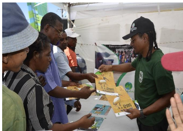
Photo 13 visitors of stand