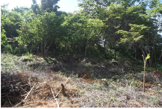
Photo 1 Clearance on the edge of forest