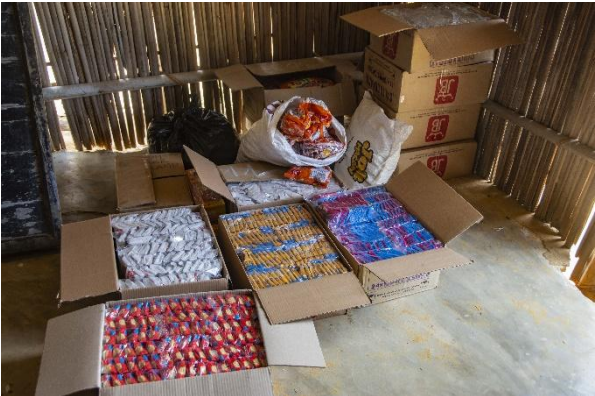
Photo 17 Cookies

Children not attending school also had their share. Around 250 children benefited from this Christmas present. They were very happy.